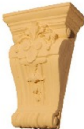
K26 L385 W280 D120