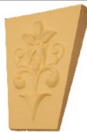
K24 L360 W290 D50