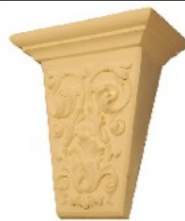
K23 L370 W365 D150