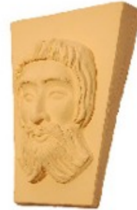
K29 L410 W300 D170