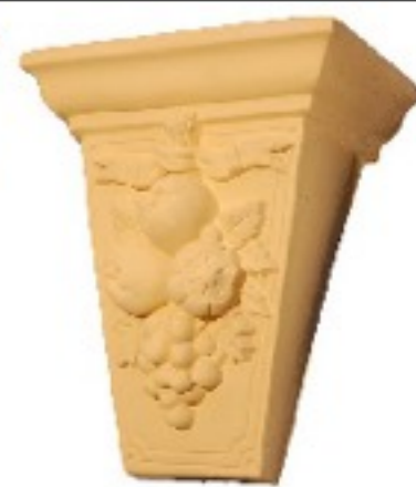
K25 L280 W260 D125