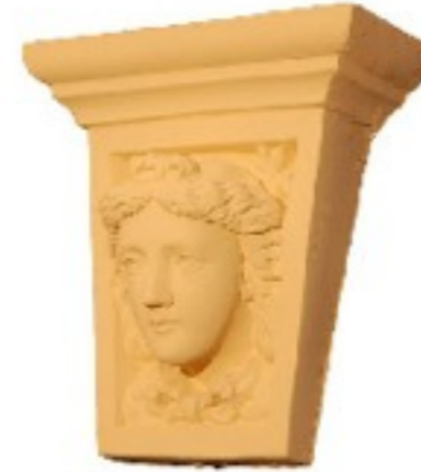
K28 L255 W245 D95