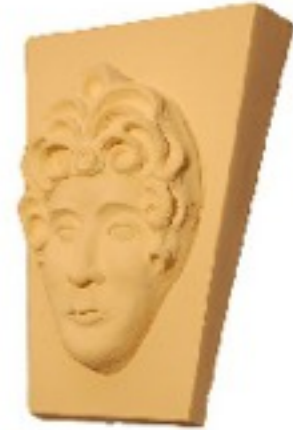
K30 L410 W300 D170