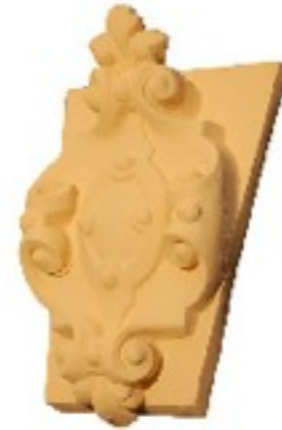
K27 L300 W230 D100