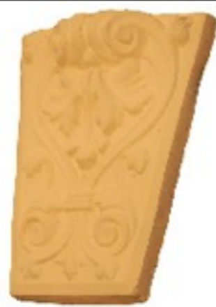
K21 L310 W240 D70