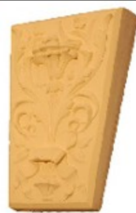
K22 L360 W255 D70